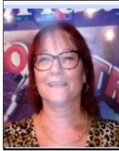
AMERICAN LEGION OFFICERS 2018-2019