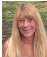
AMERICAN LEGION RIDERS OFFICERS 2018-2019