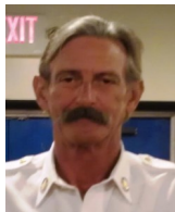
SONS OF THE AMERICAN LEGION OFFICERS 2018 - 2019