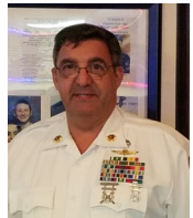
MARINE CORPS LEAGUE OFFICERS 2018-2019