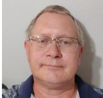
SONS OF THE AMERICAN LEGION OFFICERS 2024 - 2025