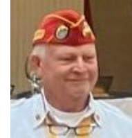
MARINE CORPS LEAGUE OFFICERS 2024-2025