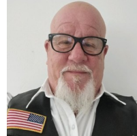
AMERICAN LEGION RIDERS OFFICERS 2024-2025