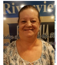
AMERICAN LEGION AUXILIARY OFFICERS 2024-2025