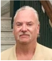
AMERICAN LEGION OFFICERS 2024-2025