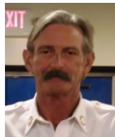
SONS OF THE AMERICAN LEGION OFFICERS 2016 - 2017