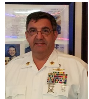
MARINE CORPS LEAGUE OFFICERS 2016-2017