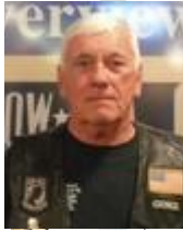
AMERICAN LEGION OFFICERS 2016-2017